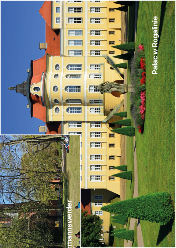
Pałac w Rogalinie