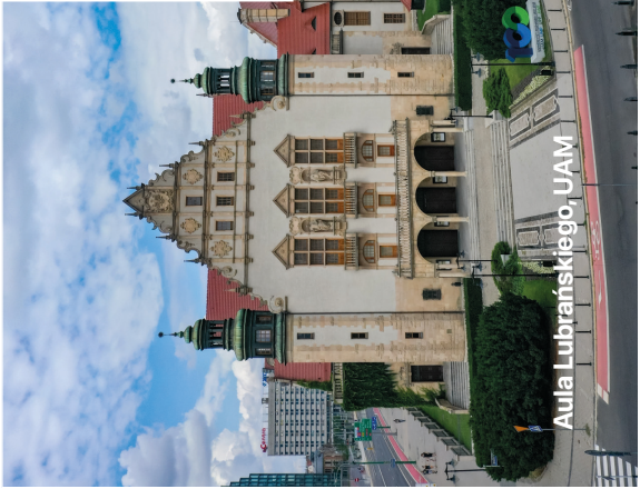
Aula Lubrańskiego, UAM